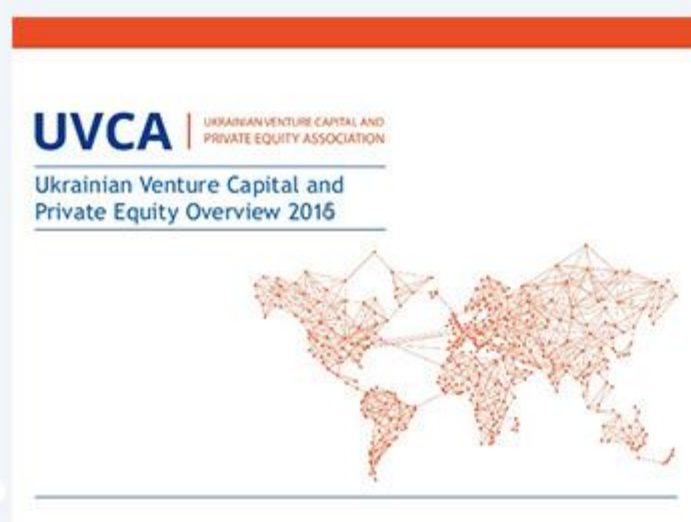
Overview 2016 coming soon