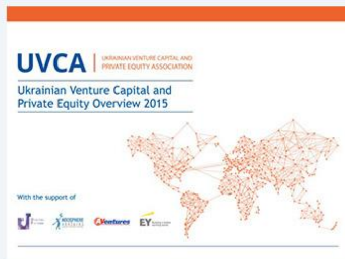
Ukrainian Venture Capital and Private Equity Overview 2015