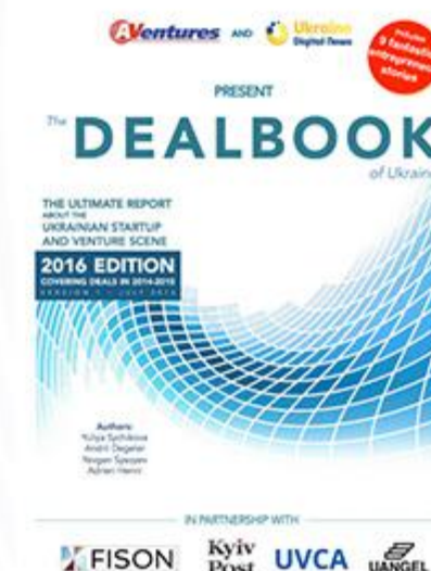
The Dealbook of Ukraine