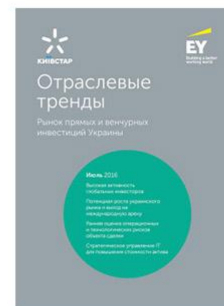
VC&PE Survey in Ukraine by EY with UVCA support for Kyivstar Industry Trends project